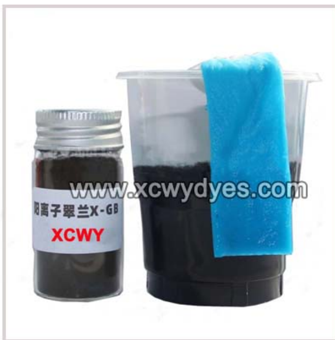
BASIC BLUE 3 CAS 33203-82-6