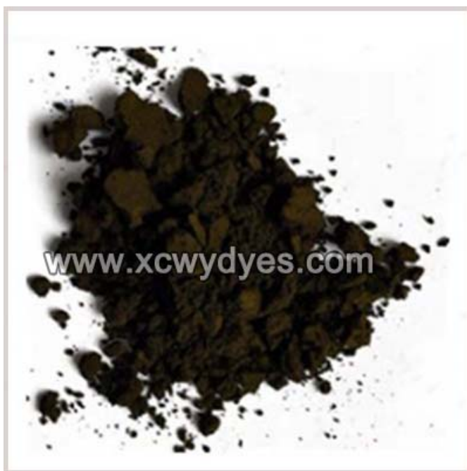
CATIONIC TURQUOISE BLUE X-GB

» Usage: Acrylic fabric dyestuff, Cotton dyestuff, Silk dyestuff