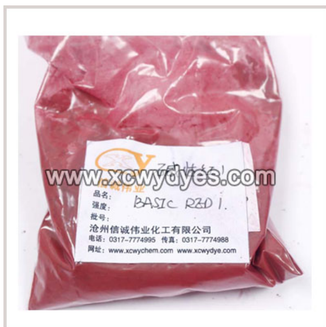
BASIC RED 1